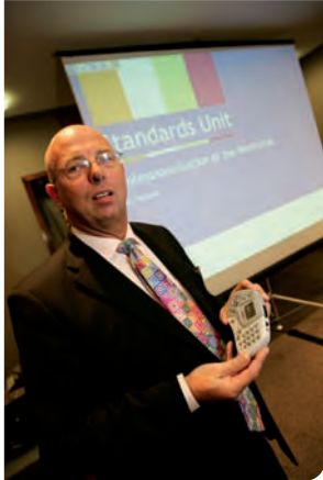
Easy to set up